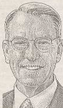
Sen. Charles Grassley

Four years ago, the Senate Finance Committee bashed the IRS for heavy-handed enforcement and took away agency powers. This week, the same body is urging tax collectors to be more aggressive.